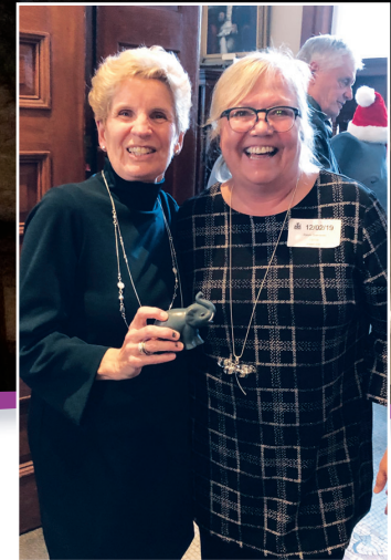
CEO with Kathleen Wynne, Former Premier of Ontario.

Emily's House and the Philip Aziz Centre for Hospice Care (PAC) strive to meet the unique palliative care needs of newborns, children, youth, and their families in our children's residence, as well as through our visiting home hospice program, which also supports adults and their caregivers. After seven years of operation, we continue to be diligent and committed to the highest standards of accountability, transparency, best practice and continual quality improvement. We intentionally engage in ongoing evaluation of programs, structure, partnerships, and donor relations, while ensuring compliance with Ministry of Health and Toronto Central LHIN performance expectations.